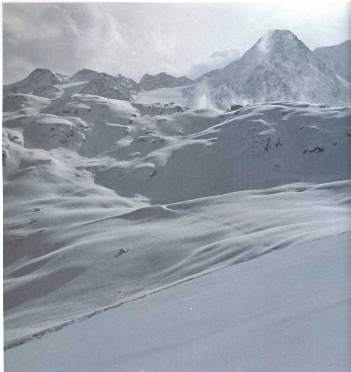
Knifing through a jagged realm of white, a skier trails a powdery plume on Switzerland's Corvatsch above